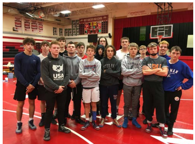
The team arrives in north Iowa.