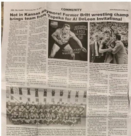
A local newspaper dedicated a full-page to Seaman Wrestling participating in the Al DeLeon Invitational.